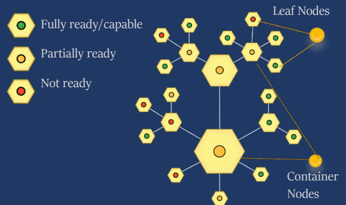
FIGURE 1: HARVEST NODE ARCHITECTURE

Harvest has a distributed node architecture (see Figure 1) that mirrors organizational structure. This architecture consists of node layers, including leaf and container nodes. Leaf nodes, which are the smallest level of reporting, are stored in larger container nodes. The architecture is presented to users as an easily navigable node tree (see Figure 2).